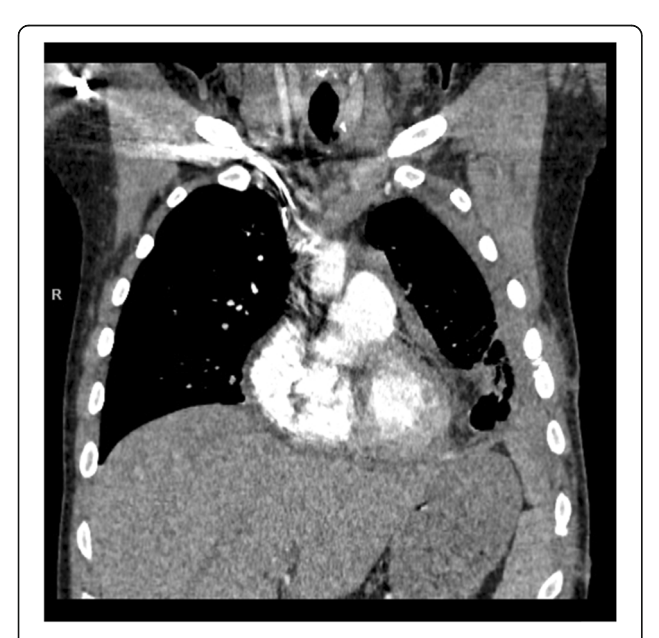
Fig. 2 Chest CT performed 27 days after intrapericardial r-tPA treatment (mediastinal window, frontal view). Pericardial effusion, the layer of 5 mm, normal thickness of pericardium. Left sided pleural effusion with inoculations

The patients were observed for 10 months (case 1), 13 months (case 2), 30 months (case 3) and 7 years (case 4) respectively. The repeated echocardiographic examinations revealed no signs of pericardial constriction, at follow –ups.