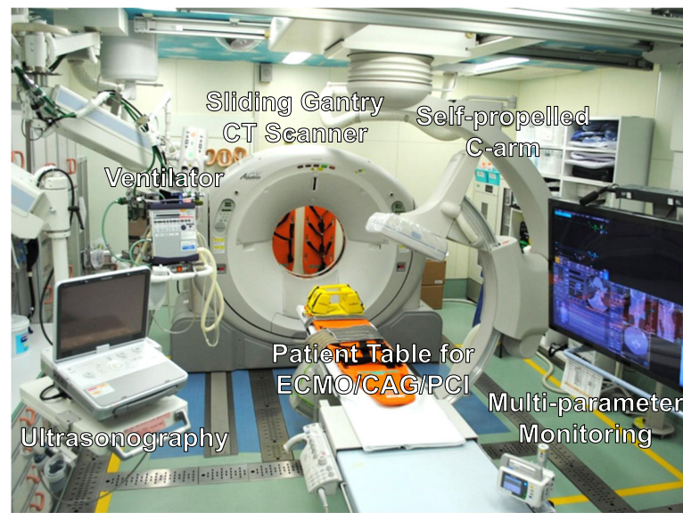
Fig. 1 A photograph showing our IR-CT system in the emergency department. All life-saving procedures including airway management, emergency surgery, and transcatheter arterial embolization can be performed on the table without relocating the patient

ratio [OR], 0.50; 95% confidence interval [CI], 0.29–0.85; p = 0.011 ) [4]. Patients treated with the HERS had shorter time intervals from ER arrival to CT examination and emergency surgery compared to those for conventional management (median [25th–75th percentiles]: 11 [8–16] min vs. 26 [21–32] min, p < 0.0001 ; 47 [37–57] min vs. 68 [51–85] min, p < 0.0001 , respectively) [4]. These beneficial observations contributed to the rapid spread of the HERS concept; as of September 2019, eleven tertiary emergency hospitals in Japan and one trauma center in Korea have installed a HERS. This system could be well adapted to ECPR, providing an expedient initiation of mechanical cardiopulmonary support for patients with non-traumatic OHCA.