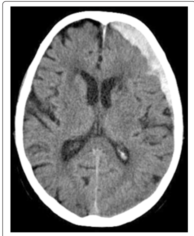
Figure 1 CT scan demonstrating the fronto-temporal subdural haematoma over the left hemisphere.

yielded growth of a Gram-positive coccus identified as L. lactis (91% with Vitek II GP). Sequencing of 500 base pairs of the gene encoding 16S rRNA as described in [11], however, revealed 99–100% identity to several sequences from L. garvieae and only 85–89% identity to L. lactis . A transthoracic echocardiography could not visualize vegetations or other abnormalities.